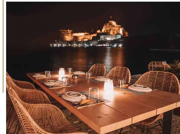
Imabari Seaside Lounge Bar and Restaurant